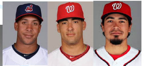
Pictured (l-r) are Brantley, Desmond and Rendon.

2014: Mike Brantley (Ft. Pierce, FL); Ian Desmond (Sarasota, FL); and Anthony Rendon (Lamar, TX).