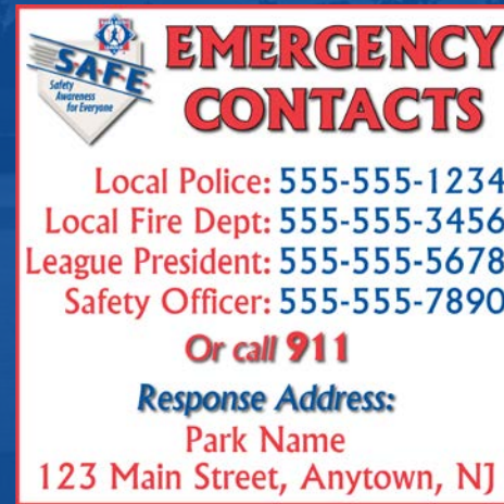
Emergency Contact List