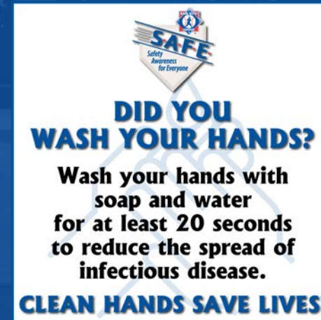
Reminder signage for restrooms, concession stands, park & dugouts